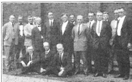
EPHPHATHA CONFERENCE, numbering 18 missionaries, in session at Chicago, July 17-21