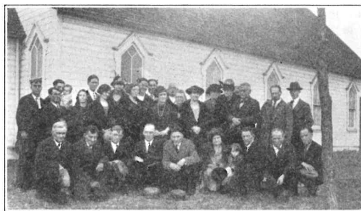
DEAF AT A SERVICE IN JOPLIN, MO.,

At the Lord's command (Luke 14, 32) we are continuing to go out into the highways and hedges with the gospel invitation and "compel" the deaf to come in. The following stations are served at the present time: Kansas City, Springfield, Joplin, and St. Joseph, Mo.; and