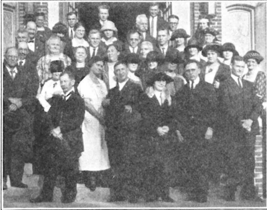
OMAHA CONGREGATION, who with us rejoices in the glorious fruits of the Reformation

congregation at Ft. Wayne, Ind., was called and placed in the Omaha field. At the first service held by the new missionary, 6 deaf were present. However, there was enough mission material among the 40 or 50 deaf who