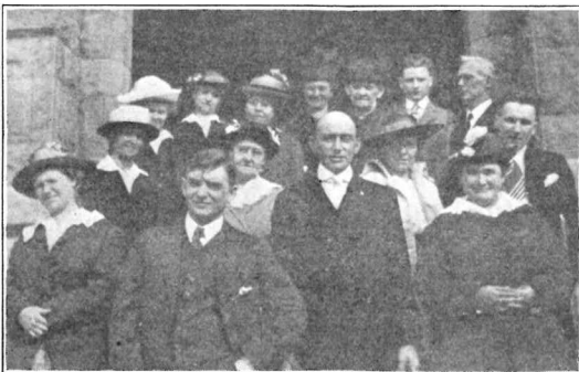
THE ST. LOUIS CONGREGATION,

Columbus, Ind., and Louisville, Ky. From 1900 to 1904 St. Louis had a resident missionary, and then monthly services for the deaf were held by non-resident missionaries. The Board of Missions to the deaf, however, saw