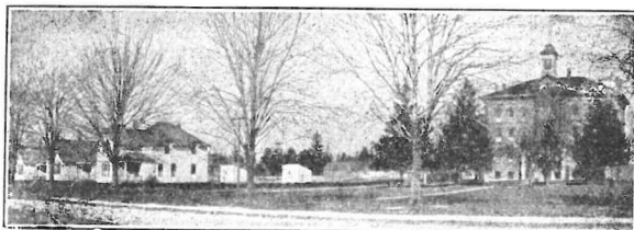
Lutheran School For The Deaf, North Detroit, Michigan.