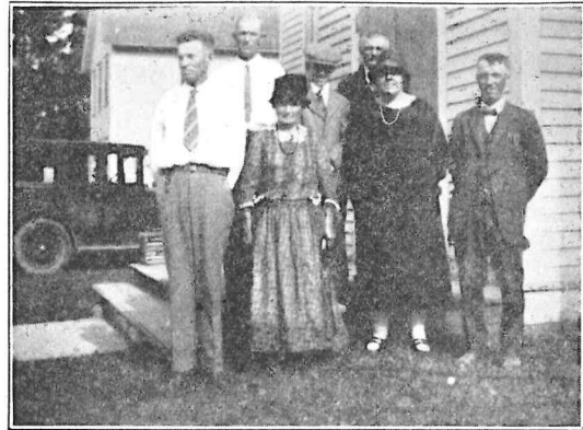
Some Lutheran deaf who attended our services in New Haven, Michigan