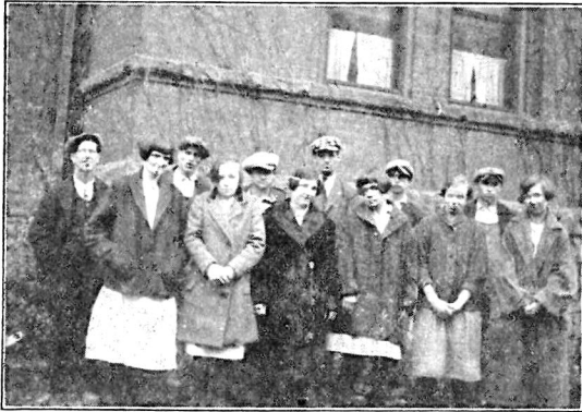
Deaf at Chippewa Falls, Wis.