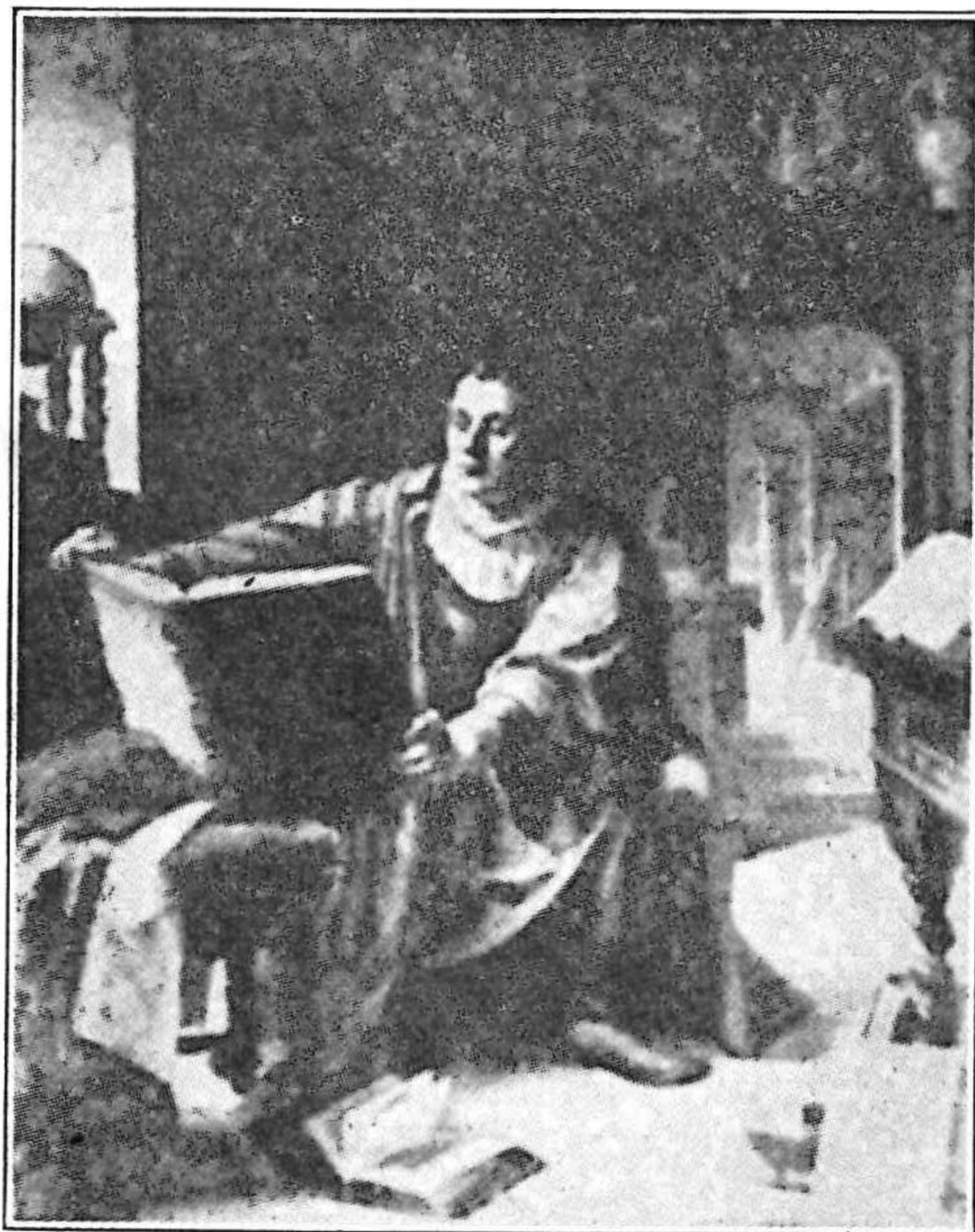
Luther finding the Bible

My name "Christian" ranks higher in my estimation because this name I have from Christ. But I also take pleasure in being called a "Lutheran." I love that form of confession of my Christian faith which my Lutheran Church teaches; and this for the following reason: Luther experienced personal Christianity, not by study or meditation on the weaknesses of the Church, but by being convicted of his own sin and helpless condition under the power of sin.