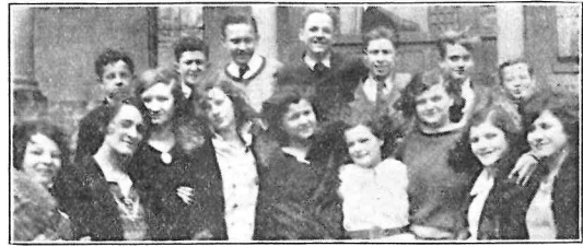
Some Lutheran pupils of our 1929-1930 Bible class at the State School for the Deaf, Columbus, O. O. C. S.