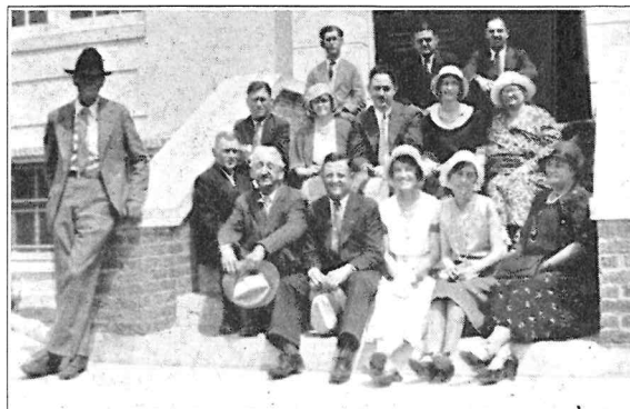
Group of Deaf who Attended Services April 17 in San Antonio, Tex.