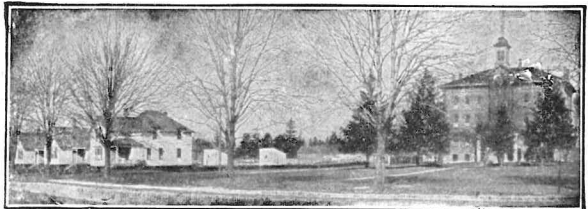
Lutheran School for the Deaf, Detroit, Mich.