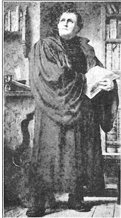
Dr. Martin Luther.

is holy in His sight. For that purpose Christ came into the world to help us from sin and finally to bring us to His home of everlasting joy. Luther expressed this truth beautifully in the following words: "Thou, Lord Jesus, art my Righteousness,