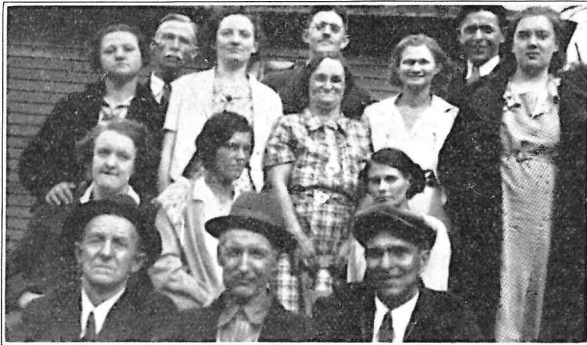
Deaf Bible Class of Harlan, Ky.

On July 16 an outdoor service was conducted with the deaf of Little Rock, Ark. About 55 deaf attended the service. After the service a delightful lunch was served by the deaf of that city. All reported having spent an enjoyable evening and suggested that this little outing be made an annual affair.