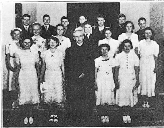
Confirmation Class, May 29, Omaha, Nebr.

During the summer picnics have been held at several places in connection with our services. On July 10 about 75 deaf gathered at Fort Dodge and on July 31 a group