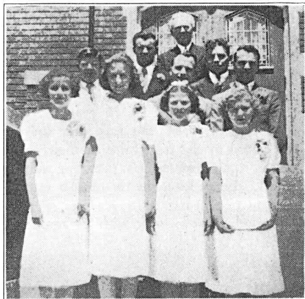
Confirmation Class of Pupils from the Council Bluffs State School

Omaha, Nebr. —A group of nine pupils from the Council Bluffs, Iowa, State School were received into membership of the Lutheran Church on May 21, three