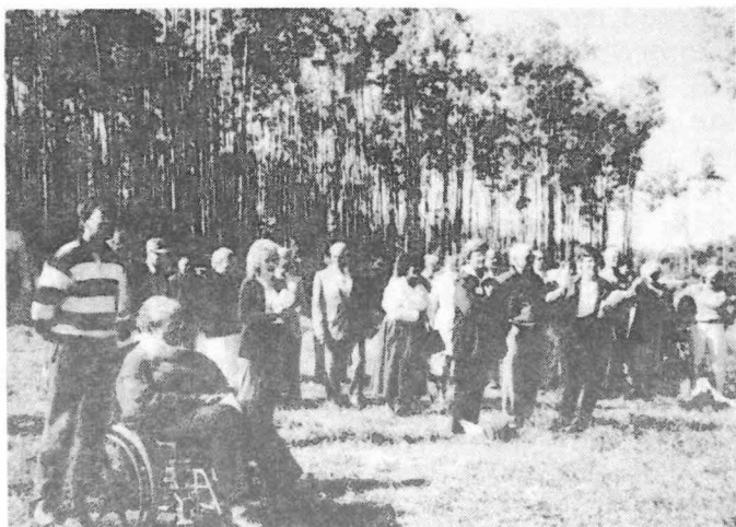
ATTENDING THE DEDICATION SERVICE--Part of the crowd watching the ceremony. Note the jackets many were wearing during the cool weather.