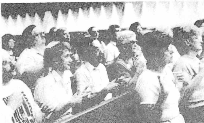
CITI STUDENTS practice interpreting a sermon in the Concordia Theological Seminary chapel.

Persons desiring more information or to register may write to the Church Interpreter Training Institute, 6600 N. Clinton St., Fort Wayne, Ind. 46825 or call 219-481-2100.