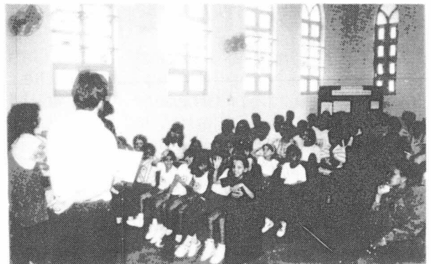
Devotions at Lutheran Church next door to school