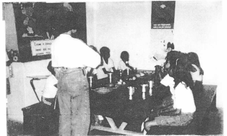
Lunch time for one of the groups