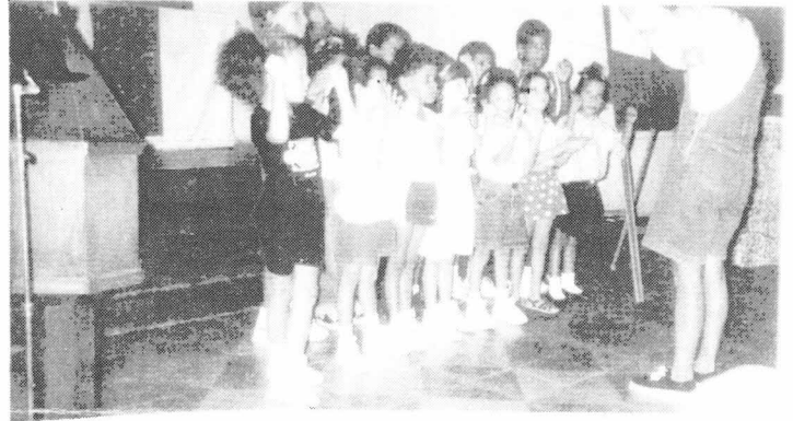
The youngest group participating in devotions