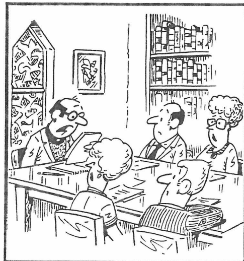
"We made $125 on the chili supper and $231 on the antacid stand."

With a little care and proper planning, there is really no need to be a victim.