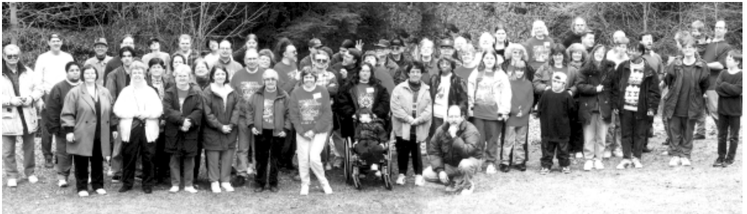
Winter Camp group shot at Camp Mowana, Mansfield, Ohio in February, 1998

Lutheran Special Education Ministries , formerly Lutheran School for the Deaf in Detroit, Michigan, observed 125th anniversary of the establishment for the deaf school on Sunday, the 29th of March. Emmanuel Lutheran Church of the Deaf in Milwaukee, Wisconsin, will celebrate 100th anniversary as the organized deaf congregation on Sunday, July 26th.